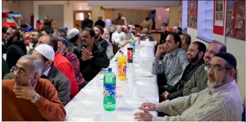
Enjoying the presentations prior to lunch.

Alhamudlillah, with the blessings of Allah SWT, the day was a wonderful success. The feedback from all present was very positive and gratefully received. The Society will endeavour to meet the needs of UK Kathorians now and in the future together with its other activities.