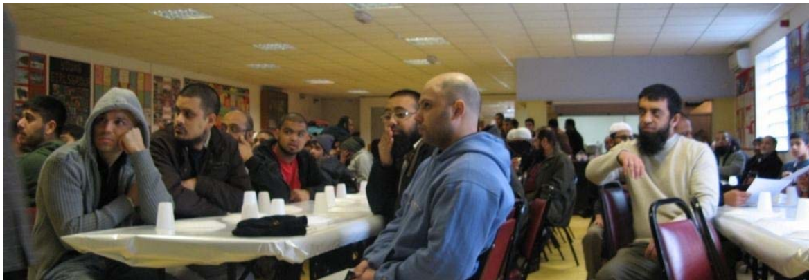
Settled down for opening words and tournament guidance.

All arrived on time at The Friendship Cafe. A light breakfast was laid out for all, many of the teams had set off early from their home towns and cities to travel to Gloucester. There was time to mingle with others, play some table tennis, a little pool and maybe even some table football to prepare for the real thing.