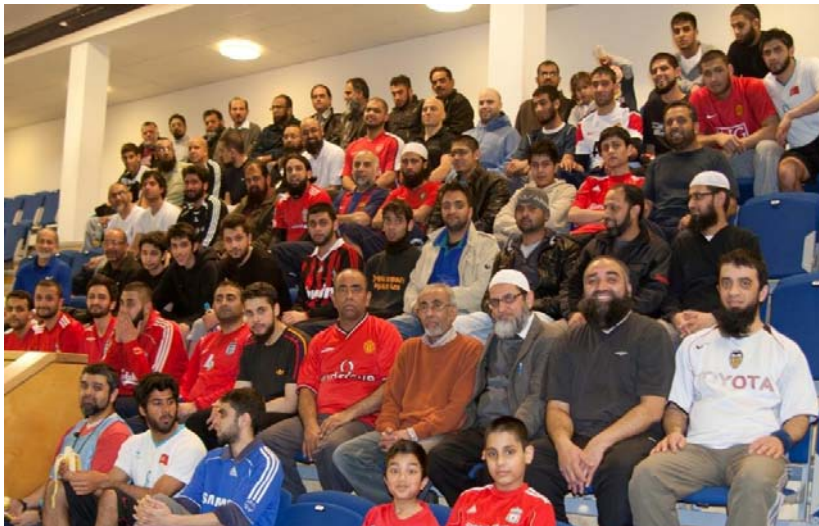
Players & guests seated for the group photo.

All were anticipating a good match, Nuneaton Allstars had maintained their 100% record throughout. Could they take that final step? The London Dohas had recovered from a