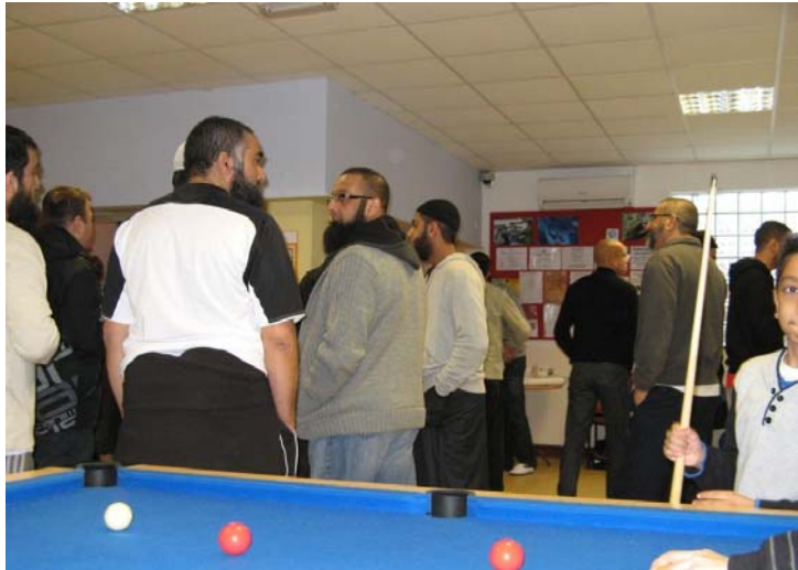
Arrival & breakfast at the Friendship Cafe.

An event in the thoughts of the Society for many years was finally about to happen. The venue - Gloucester. Teams arriving from across the country – London, Gloucester, Preston, Leicester, Birmingham and Nuneaton. A total of eight teams were ready to compete to become the first Kathorian five-a-side football champions.